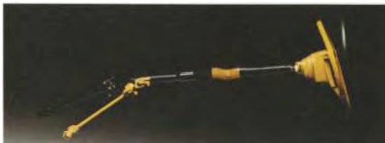
The steering mechanism: many ingenious safety features.

The Volvo bodies, for instance, are very strong and torsionally stiff. The passenger compartments are designed as a safety cage and the front and rear ends are energy-absorbing.