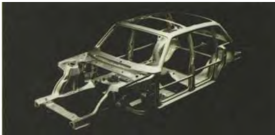
closed section profiles form a reliable safety cage.

Over the years, Volvo has shown a deep interest in different aspects of car safety. As a result, many of the safety features introduced by Volvo, have been clearly ahead of legislation. All the Volvo car series are designed to give a high degree of safety and to avoid injuries to a great extent in case of an accident.