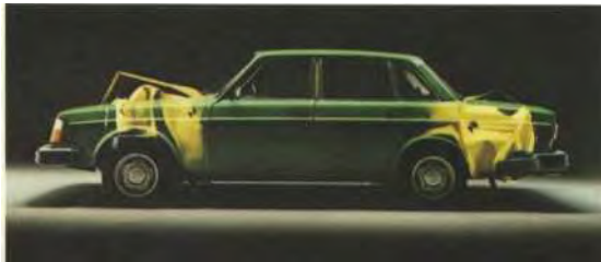
Front and rear ends have energy-absorbing crumple zones.

The Volvo bodies, for instance, are very strong and torsionally stiff. The passenger compartments are designed as a safety cage and the front and rear ends are energy-absorbing.