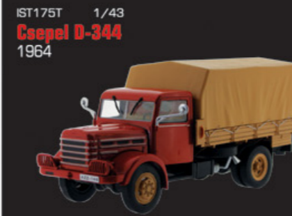
IST175T 1/43 Csepeľ D-344 1964