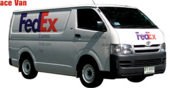
JC222 1/43 Toyota Hiace Van "Fedex" 2008