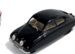
PRD374 1/43 SAAB "Urstaab" 1974 Black