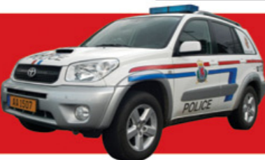
JC183 1/43 TOYOTA Rav 4 Luxemburg POLICE 2004

THE DIECAST CLUB www.the-diecast-club.com