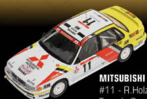
MITSUBISHI Galant VR4-EVO #11 - R.Holzer - K.Wendel Tour de Corse - 1991 RAC 223 1/43