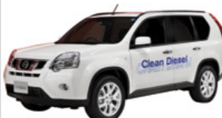
JC173 1/43 Nissan Xtrail Clean Diesel Prototype GB Summit 2008