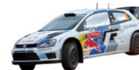
RAM544 1/43 Citroen DS3 WRC #22 B.Bouffier-X.Panseri Rally Monte Carlo 2013