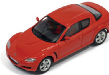
PRD332 1/43 Mazda RX-8 2003 Orange