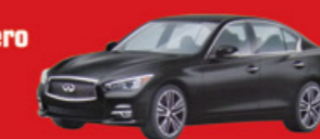
JC290 1/43 Nissan Skyline (L53H) 2013 Black