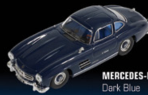
MERCEDES-BENZ 300 SL Dark Blue 1955 CLC 245 1/43