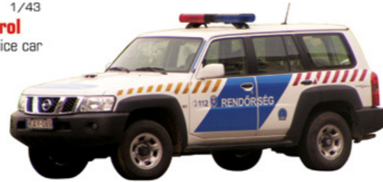
JC103 1/43 Nissan Patrol Hungarian Police car 2007