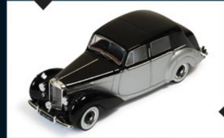
MUS052 1/43 Bentley MK VI 1950 Black and Silver

The Bentley Mark VI 4-door standard steel sports saloon was the first post-war luxury car from Bentley. Announced in May 1946 and produced from 1946 to 1952 it was also the first complete car assembled and finished at their factory.