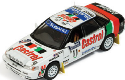
RAC230 1/43 Subaru Legacy RS #11 P.Bourne-R.Freeth Rally New Zealand 1990 The Legacy wasn't considered a competitive model, but showed promise with Markku Alen, who in 1991 finish 3rd at Sweden.