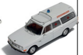
PRD319 1/43 Volvo 145 Express 1971 Dutch Ambulance