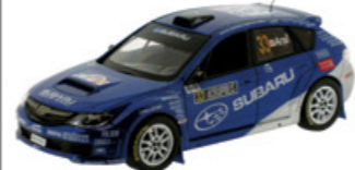
JC195 1/43 Subaru Impreza WRX STI Group N T.Arai Rally Acropolis 2009