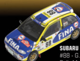
SUBARU Vivio RX-R #88 - G.Cadringer Rally Monte Carlo - 1999 RAM 531 1/43