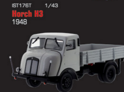
IST176T 1/43 Horch H3 1948