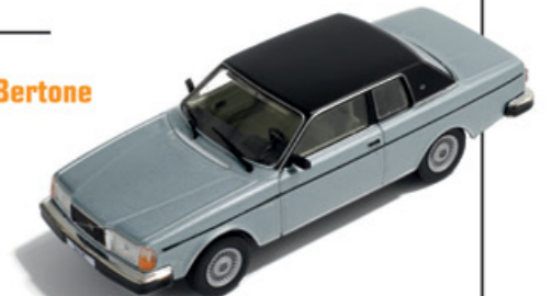
PRD370 1/43 Volvo 262 Coupé Bertone 1977 Silver