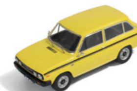
PRD299 1/43 Volvo 66 1975 Yellow