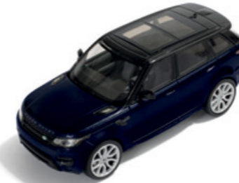
PRD 359/360 1/43 Range Rover Sport 2014 Blue/White