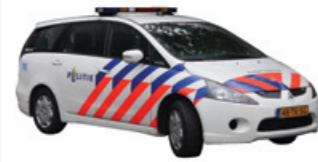
JC170 1/43 Mitsubishi Grandis Holland Police Car (Eindhoven) 2005