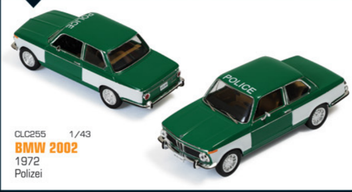
CLC255 1/43 BMW 2002 1972 Polizei

CLC189 1/43 Jeep C7 Laredo 1986 Dark Brown CLC251 1/43 CHEVROLET CORVETTE C3 1980 Silver/Black CLC254 1/43 BMW 2002 1972 Dark Blue