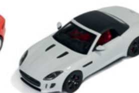
PRD303 1/43 Jaguar F-Type 2013 White With Soft Top