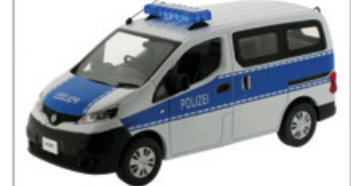
JC241 1/43 Nissan NV200 "Polizei" 2010 (Prototype)