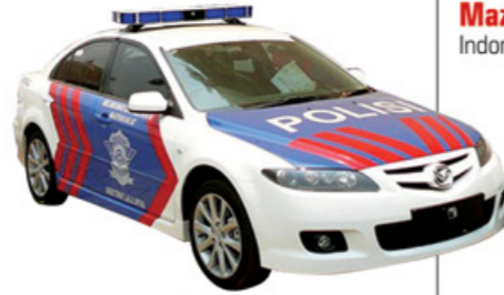
JC178 1/43 Mazda 6 Hatchback Indonesia Highway Patrol