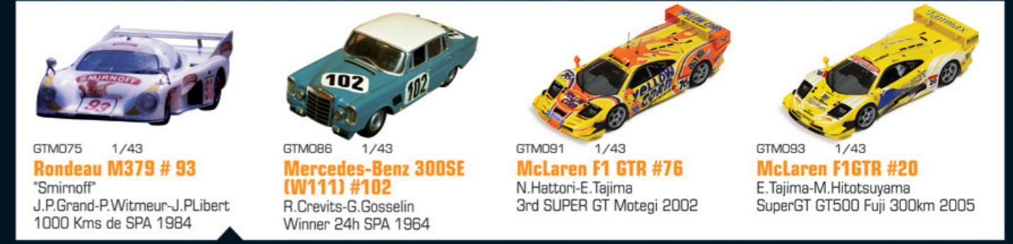
GTM075 1/43 Rondeau M379 # 93 "Smirnoff" J.P.Grand-P.Witmeur-J.PLibert 1000 Kms de SPA 1984 GTM086 1/43 Mercedes-Benz 300SE (W111) #102 R.Crevits-G.Gosselin Winner 24h SPA 1964 GTM091 1/43 McLaren F1 GTR #76 N.Hattori-E.Tajima 3rd SUPER GT Motegi 2002 GTM093 1/43 McLaren F1GTR #20 E.Tajima-M.Hitotsuyama SuperGT GT500 Fuji 300km 2005