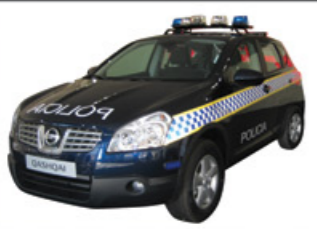
JC168 1/43 Nissan Qashqai Barcelona Police Car Prototype 2009