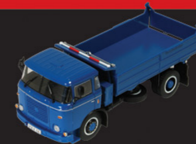
IST174T 1/43 Liaz MTS 24 1977 Dark Blue