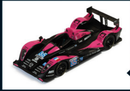
LMM204 1/43 Pescarolo 01-Judd #35 G.Moreau-M.Lahaye-J.Charouz Le Mans 2010