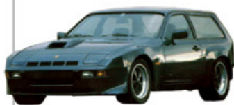
PRO378 1/43 Porsche 924 Turbo Kombi "Artz" - 1981 Dark Blue