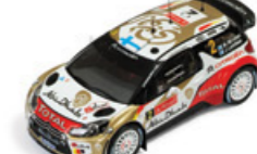
RAM550 1/43 Citroen DS3 WRC #2 M.Hirvonen-J.Lehtinen 2nd Rally de Portugal 2013