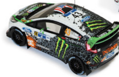
RAM507 1/43 Ford Fiesta RS WRC #43 K.Block-A.Gelsomino Rally Mexico 2012

It is built to the new WRC regulations for 2011, but is powered by a turbocharged 1.6-litre engine rather than the normally aspirated 2-litre engine found in Super 2000 cars.