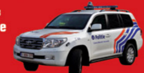
JC297 1/43 Toyota Land Cruiser 200 Belgium Federal Police Car 2011