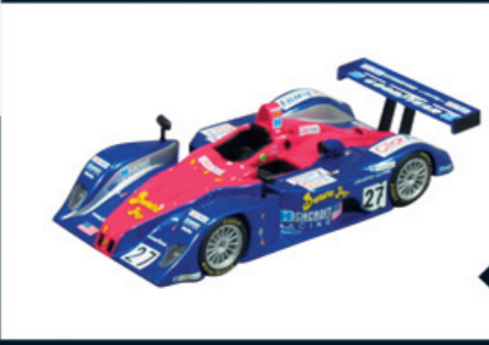
LMM103 1/43 MG Lola EX257 #27 J.Field-D.Dayton-R.Sutherland Le Mans 2003