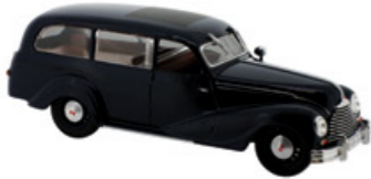
IST055 1/43 EMW 340 Kombi 1953 Black

The BMW 340, subsequently rebadged as the EMW 340, was a large six-cylinder four-door passenger saloon produced at Eisenach initially in the name of BMW. Five-door 340 station wagons were also manufactured.