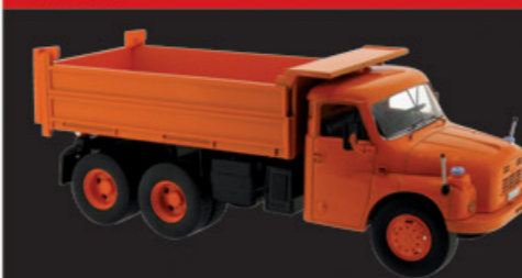
IST171T 1/43 Tatra 148 1972