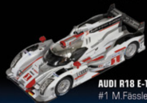
AUDI R18 E-TRON QUATTRO #1 M.Fässler - A.Lotterer - B.Tréluyer 24H Le Mans - 2012 LMP1 (Winner) LM 2012 1/43