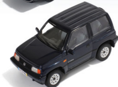
PRD328 1/43 Suzuki Vitara 1992 Metallic Dark Blue