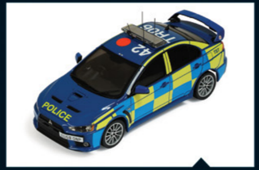
MOC116 1/43 Mitsubishi Lancer EVO X "UK Police" 2008 Blue

MOC114 1/43 Mitsubishi Lancer EVO X Group N WRC "Rally Edition" 2007 Red • High Performance Package n Bilstein single tube shock absorbers and Eibach coil springs • Rally Exterior Package