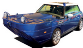
PRO275 1/43 Mini Cooper Yatchsman 2012 Blue Our youngest range offers an eclectic selection of models, namely American Cars of the 70's and 80's.