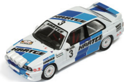
RAC202 1/43 BMW M3 (E30) #3 Carlsson-Carlsson Rallye DEUTSCHLAND 1990 (with Extra Lights)