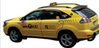
JC175 1/43 Lexus RX400h New York Taxi 2007