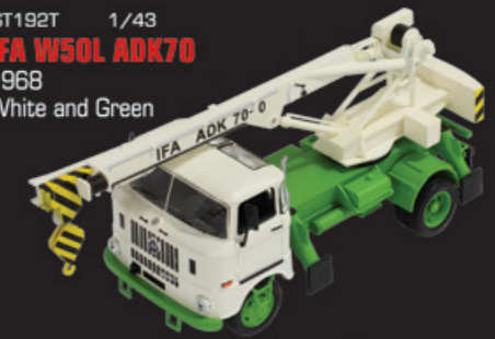
IST192T 1/43 IFA W50L ADK70 1968 White and Green