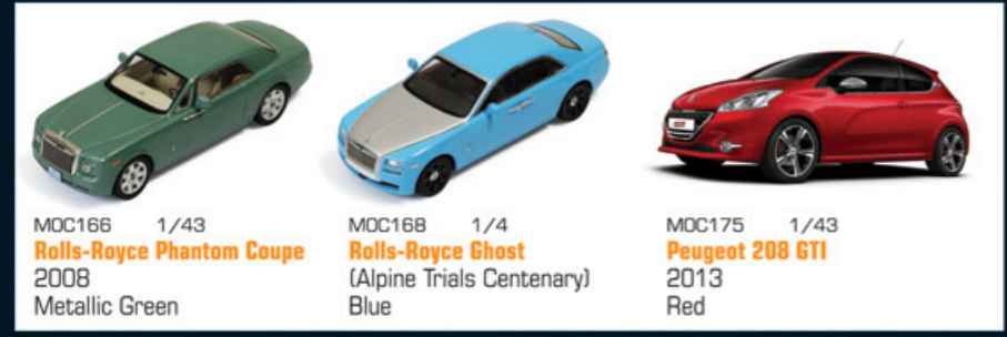
MOC166 1/43 Rolls-Royce Phantom Coupe 2008 Metallic Green MOC168 1/4 Rolls-Royce Ghost (Alpine Trials Centenary) Blue MOC175 1/43 Peugeot 208 GTI 2013 Red

MOC154 1/43 Lamborghini Aventador 2013 Dubai Police The Lamborghini Aventador is a two-door, two-seater sports car publicly introduced by Lamborghini at the Geneva Motor Show.