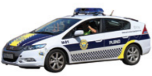
JC184 1/43 Honda Insight "Spanish Benidorm Police" 2010