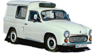
IST088 1/43 Syrena 105 Bosto 1972 Grey

The Syrena Bosto and its sister, the R-20, were first introduced to the 104 models of Syrena. The name is an acronym of Bielski Osobowo-Towarowy, or Passenger-Cargo of Bielsko. The first model of the Bosto was revealed in December 1971.