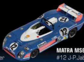
MATRA MS670B #12 J-P.Jabouille - J-P.Jaussaud Le Mans 1973 LMC 114 1/43