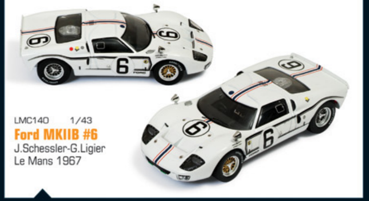
LMC140 1/43 Ford MKIIB #6 J.Schessler-G.Ligier Le Mans 1967

LM1979 1/43 Porsche 935 K3 #41 K.Ludwig-B.Whittington-D.Whittington Winner LE MANS 1979 LM1981 1/43 Porsche 936 #11 J.Ickx-D.Bell Winner Le Mans 1981