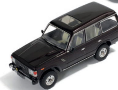
PRD 348 1/43 Toyota Land Cruiser 1982 Dark Brown