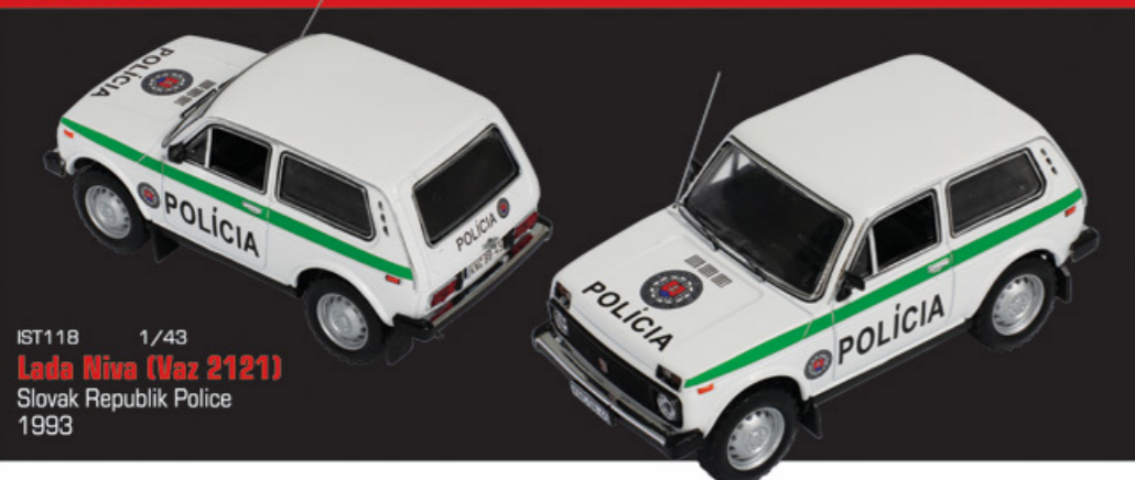
IST118 1/43 Lada Niva (Vaz 2121) Slovak Republic Police 1993