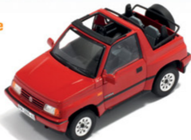
PRD329 1/43 Suzuki Vitara Convertible 1992 Red