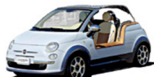
PRO255 1/43 Fiat 500 Tender Two "Castagna Milano" 2008 Light Blue