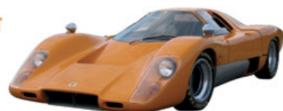
PRO257 1/43 McLaren M6 GT 1969 Orange