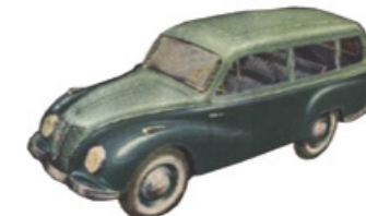
IST060 1/43 IFA F9 Kombi 1953 2-TONES Green