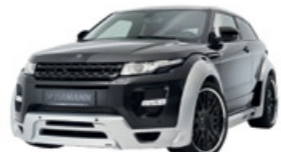
PRO274 1/43 Range Rover Evoque 2012 "Hamann" Black