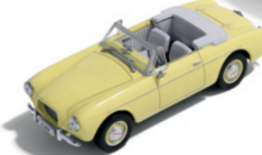
PRD372 1/43 Volvo P1900 Sport Convertible 1955 Light Yellow