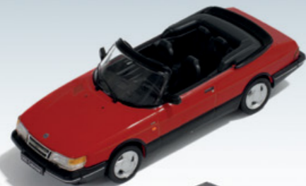
PRD 377 1/43 SAAB 900 Cabriolet 1991 Red