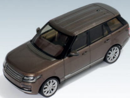
PRD304/305 1/43 RANGE ROVER L405 2013 Bronze/Black