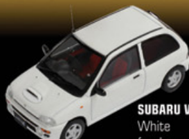
SUBARU Vivio RX-RA White (early version) - 1992 MOC 158 1/43