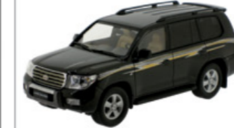
JC232 1/43 Toyota Land Cruiser 200 VXR V8 2010 Black