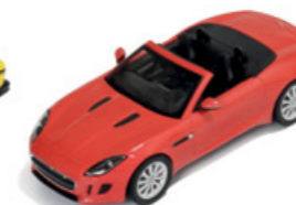
PRD301/302 1/43 Jaguar F-Type V8 S 2013 Black/Red